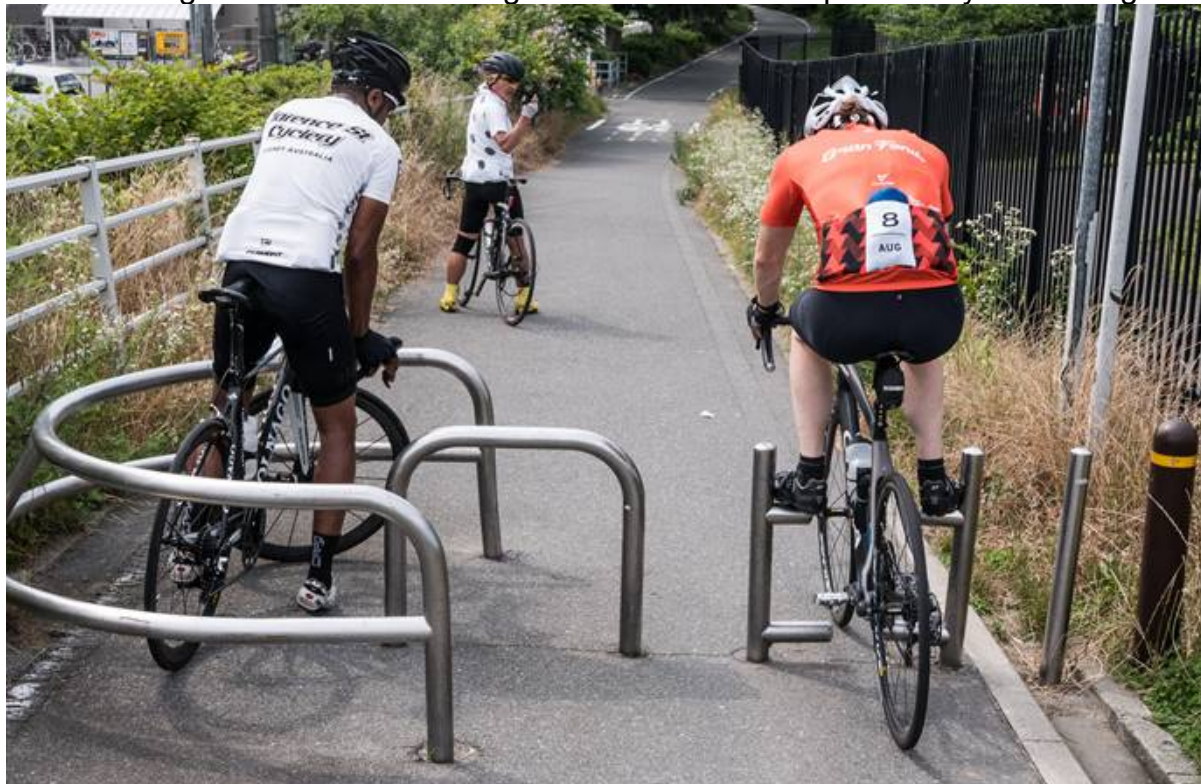
Example of a Single chicane and “cycle only” bollard

I would recommend the path be uniformly illuminated with dusk till dawn with the standard approx. 4m. lamp standards with LED lighting which would provide a greater level of consistent illumination and colour rendition. This I believe to be especially important due to the clumps of mature trees located along the route which during the winter months is particularly dark and gloomy.